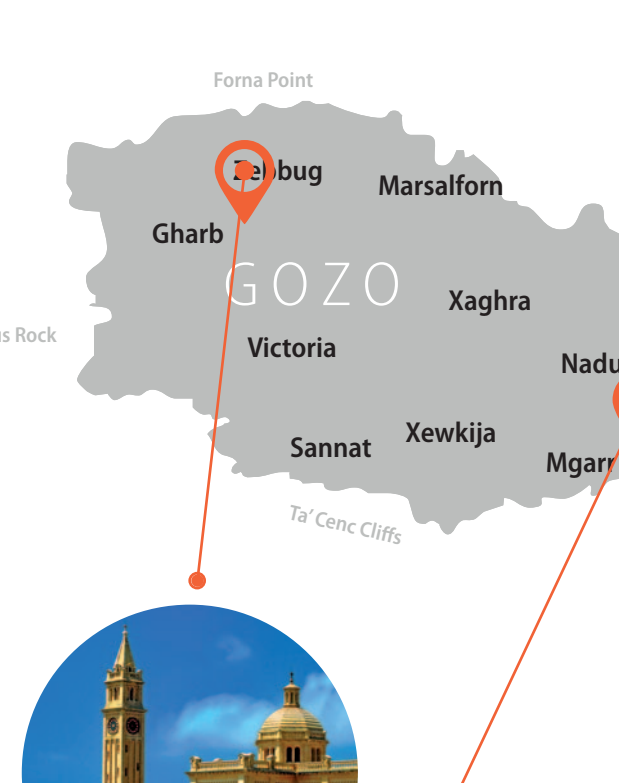
Tá Pinu Church

Ten-pin bowling, segway tours, jeep safaris, paintball and a plethora of audiovisual cultural and historical shows!